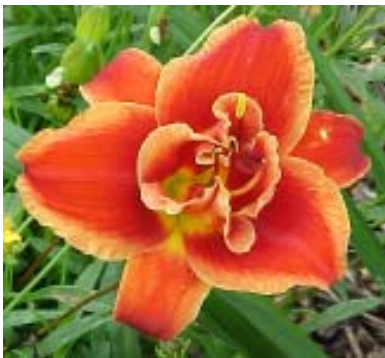
FIRES OF FUJI

In addition to these, Betty has created a number of other doubles, including her TANGLEWOOD, a uniquely colored chocolate rose terra cotta double, and GRECIAN SANDS, a cream washed lavender pink. Her ARTISAN'S QUILT is a rose lavender with a creamy watermark eye, one of the first watermark eyes in double tetraploids. Her DOUBLE DANDELION is one of her finest yellow doubles. And these are but a few of her fabulous double introductions.