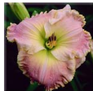
WHITE NOISE (from tet GRACE PIERCE)

VG: How do you choose what diploids you are going to convert?