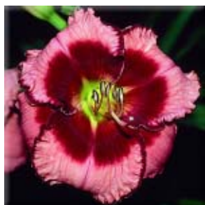
DESERT MOON (from tet DRAGON'S EYE)