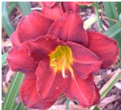
COUNTRY INN ROSE COURT