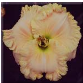
ISLE OF WIGHT (from tet RUFFLED MASTERPIECE)