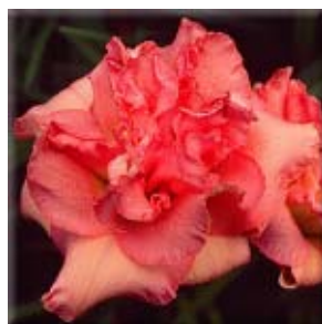
KINGS POINT (from tet FRANCES JOINER)