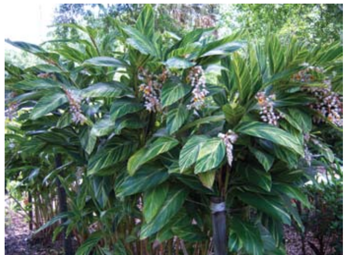
A shot of one of the open gardens for the 2009 National event - Dan and Loye Stateler's garden